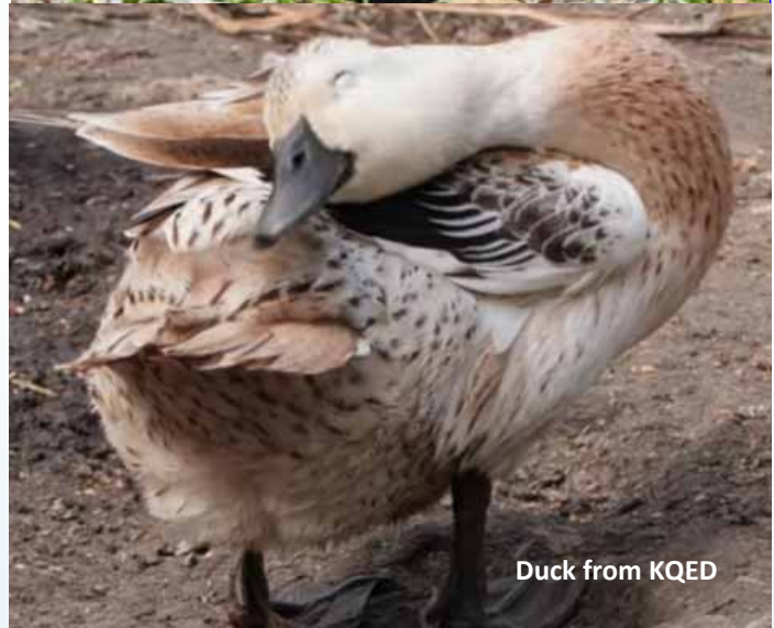
Duck from KQED

The DNA programming to make a Uropygial Gland is not something that would happen over many years through repeated errors in the reproduction process. That this complex process exists is clear proof of an intelligent designer.