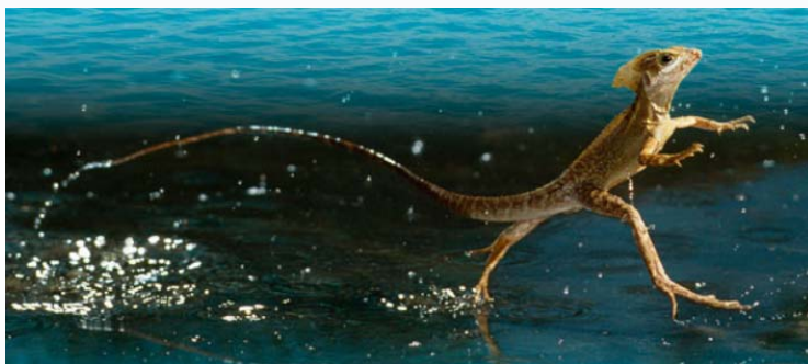
WATER LIZZARD

We have 2 good cases of this in nature. The first is a Water Lizzard.