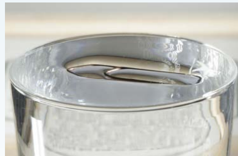
PAPER CLIP By Kuebi Armin Kübelbeck

What is happening is better seen in the following figure showing a paperclip