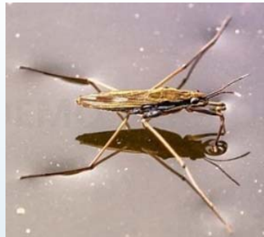
WATER STRIDER, NATUREGUYS.ORG

Now imagine a heavier than water creature recognizing that the phenomenon happens and then takes advantage of it by walking on water.