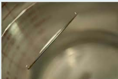
WATER COMPASS https://www.quora.com/

For a second case, consider the compass you may have made as a child as seen in the following image.