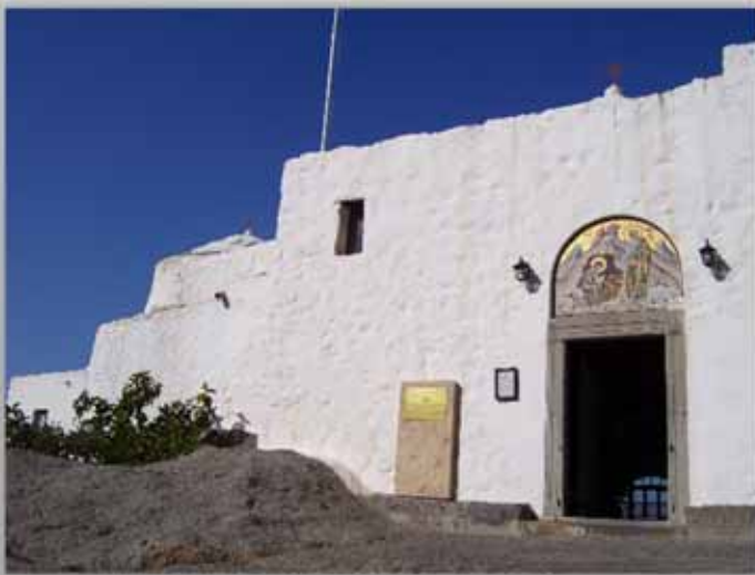
FIRST ENTRANCE TO CAVE OF THE APOCALYPSE

As you approach the Cave of the Apocalypse, it doesn't look like a cave at all 2000 years later. It actually looks like a plain white single story building. How many churches have evolved enough over the past 2000 years to not be recognizable?