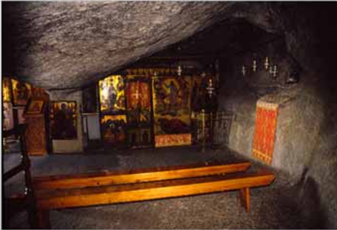
GREEK ORTHODOX CHURCH IN CAVE OF THE APOCALYPSE

On visiting one of the Greek Orthodox monasteries, we purchased a book ( The Way ) to get the following timeline. This timeline represents their understanding of church history. The universal Pope we learn about in AD 606 was a non-event. He was simply one of the officious Bishops claiming authority over the other Bishops, who did not recognize the authority. The great Schism occurred in 1054 when Pope Leo IX (Roman Catholic) and Patriarch Michael I (Greek Orthodox) excommunicated each other. The Crusades were important in that they were a Roman Catholic event in which they attacked