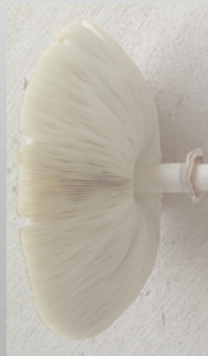
Note the complexity of a simple mushroom

We are poised for the next great surge of church growth. The first great surge of growth came with the invention of the printing press (1454 AD) and early translators who gave their lives to translate the Bible into the common man's language. William Tyndale (1494-1536) literally gave his life for translating the Bible into English. His desire was that every boy who drives a plow would know more of scripture than the clergy. Some are slow about moving the message into current language and communication tools. Our language radically changes every decade or sooner yet some are still trying to teach with the King James Bible of 1611. We can do more to help every child understand Scripture.