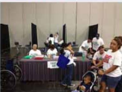
FIRST AID ASSISTANCE