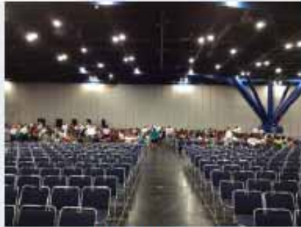
INSIDE QUE AND GREETINGS