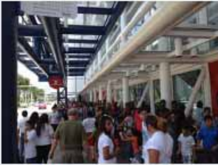
WAITING LINE TO GET IN