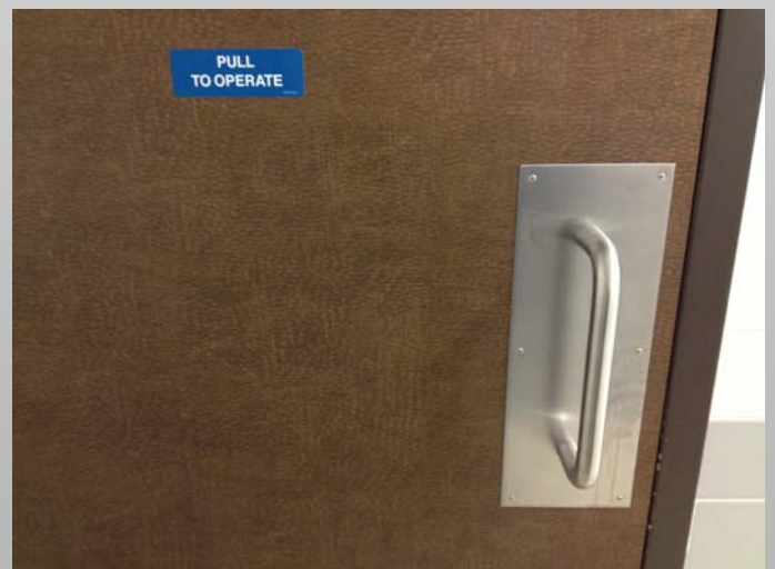
The graphic above was on a restroom door at a local college.

After each of these spectacular steps are taken, "2 eyes" must conceive that if it can judge the angle between its eyes when looking at the object (your finger) it can estimate the distance. It doesn't do any good if he conceives the need and dies, in one generation. He must conceive of it, implement it, and change his DNA to pass this new capability on to his offspring.