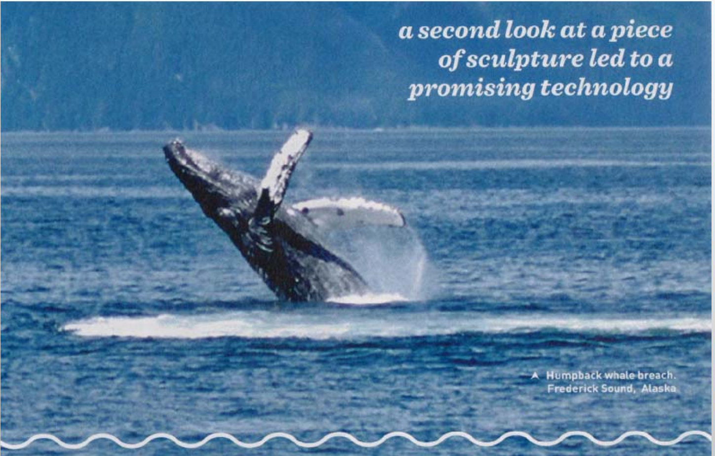
▲ Humpback whale breach. Frederick Sound, Alaska

a second look at a piece of sculpture led to a promising technology